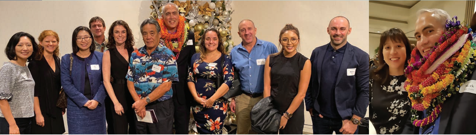
The proud alumni of the University of Hawaii's William S. Richardson School of Law.